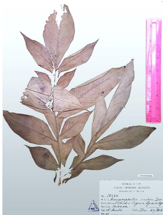
Fig. 2. Amorphophallus konjac K. Koch, Specimen observed in HAC, under the synonym Amorphophallus rivieri Durieu ex Carrière.