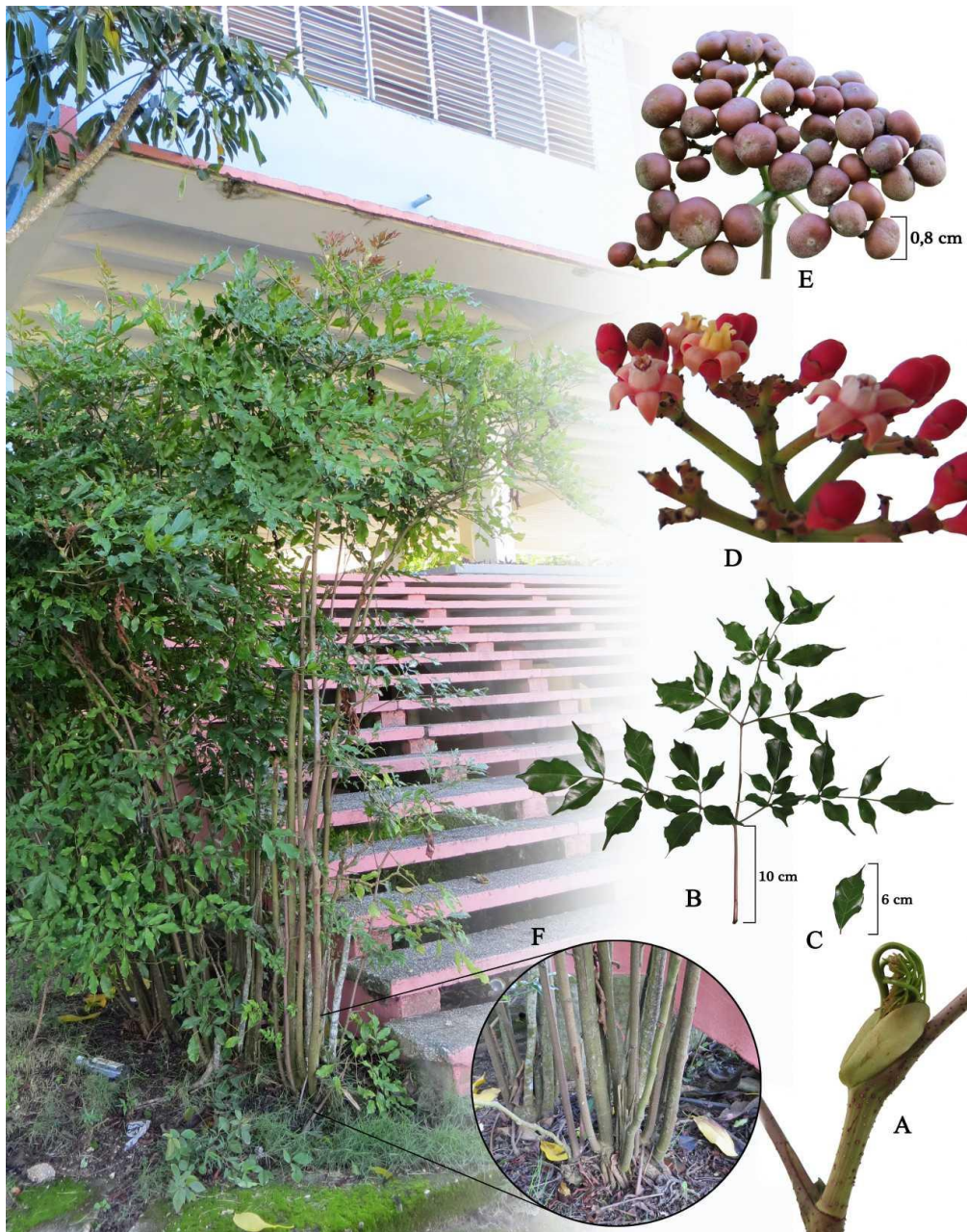
Fig. 1. Leea guineensis G. Don G. (Vitaceae) A) Branch with stipule and shoot. B) Leaf C) Leaflet D) Inflorescence F) Stem base. Garden of the Ignacio Agramonte Loynaz University of Camagüey.

Originally from Africa, Asia, and the Pacific (Ridsdal, 1974). Africa: it grows in the Gulf of Guinea Sao Tome Islands, Madagascar, Bourbon, and Mauricius. Asia: India, Burma, Thailand, Cambodia, Laos, Thailand Malaysia, Sumatra, and Java. The Pacific: The Philippines, Taiwan, Micronesia, and New Guinea. It is widely cultivated in several parts of the world, including La Española and Puerto Rico (Acevedo-Rodríguez, P. & Strong, 2012). Information about the time it