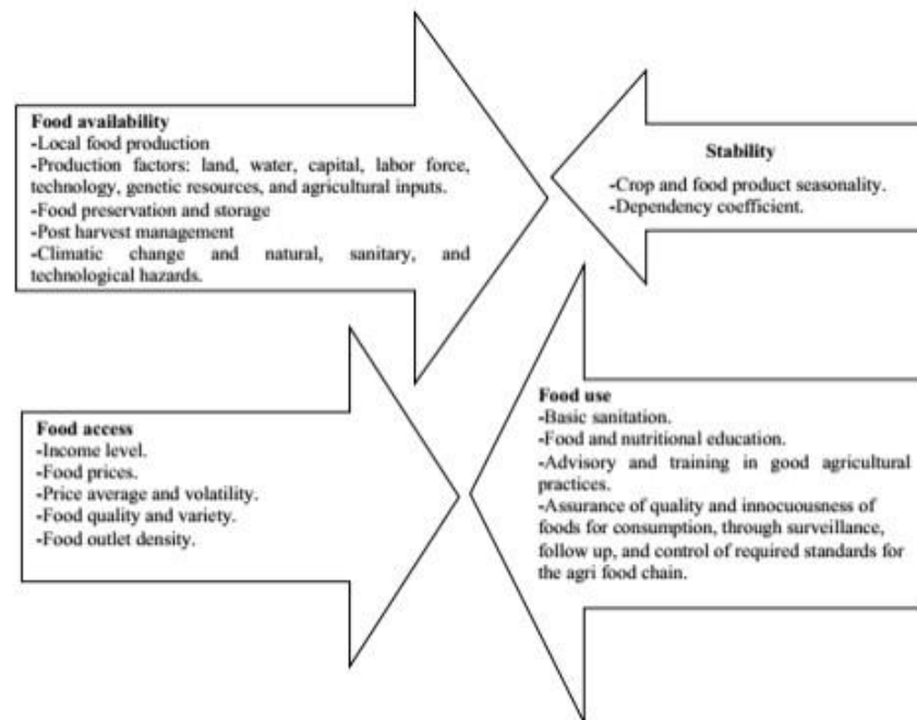
Figure 2. Factors determining food safety by dimensions. Based on FAO (2004) through previous consultation of authors in Table 1.

In that respect, Iglesias (2002: 23) said that the value chain is a tool to cope with increased market dynamics, but it should not be an end by itself. In short, the agri food chain with a value chain approach offers a better response to consumer markets, with its efficiency, efficacy, and demand orientation. However, the end should be related to fair prices, dignifying access to food, environmental sustainability, and satisfaction of the people's needs and preferences to lead active and healthy lives. The previous would imply the inclusion of social liability, which can be reflected in its transparent mission and action, not just a means to create the necessary value, be more competitive, or establish in the market.